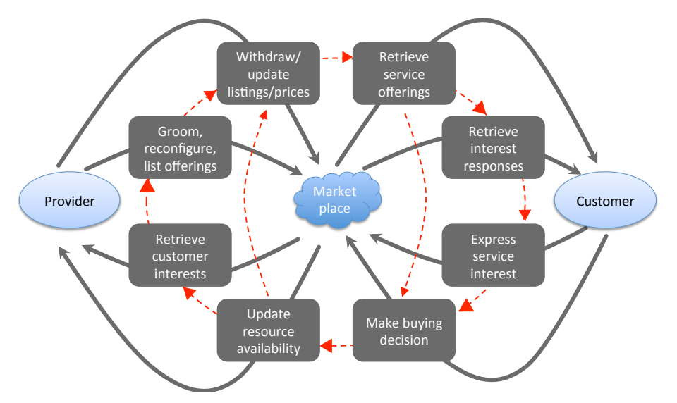
Fig. 2: Entities and interactions for convergence ecosystem

entity, especially since it need be little more than an agile directory with search capabilities. The labeled solid arrows in Figure 2 show the different possible interactions between the entities, and the dotted arrows represent the most typical order of the various interactions in the life-cycle of the convergence of network capabilities and customer requirements, and the resulting collaborative dynamic optimization of the network resources. Although we have indicated an order, the interactions are obviously asynchronous and can take place in any order, and each is executed an indefinite number of times, on an ongoing basis, for a given provider or customer.